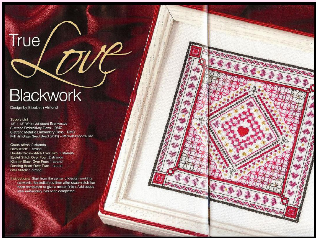
True Love CH0274

My thanks go to 'The Cross Stitcher' magazine for publishing one of my designs in their February issue. As a designer it is a great boost to see a chart in print and without the support of editors and their magazines my designs would not reach such a wide audience.